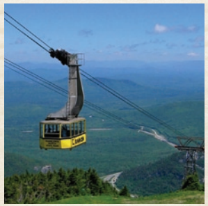
Cannon Mountain Aerial Tramway